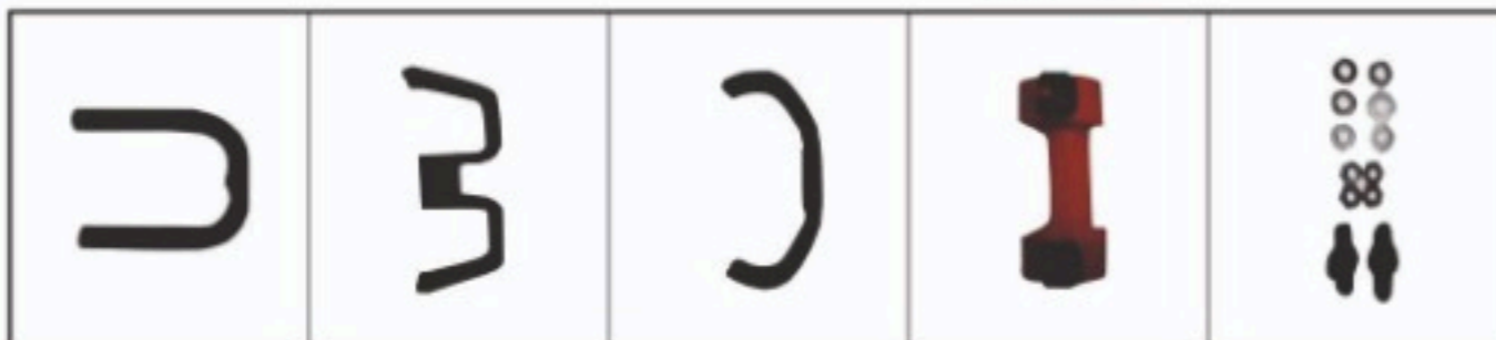
1 Pull Handle 1 Backrest Armrest 1 Front Handle 1 Front Bumper 1 Screw Bag 1 Bag