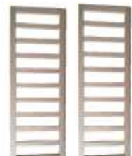
Connecting Beams : 2