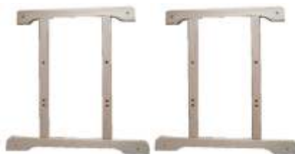
Support Frame : 2