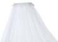
Mosquito Net : 1