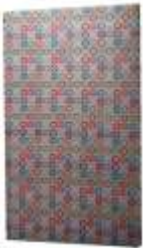
Bed Board : 1