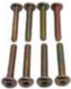
M6*35 mm Bolts : 8